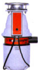
WESTMINSTER Batch and continuous feed