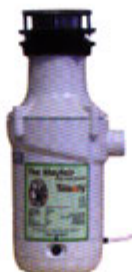
MAYFAIR Top of the range continuous feed