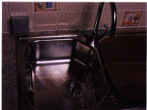
The task done - it's that easy!