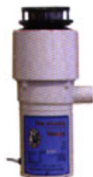
VICTORIA For those with budgets in mind