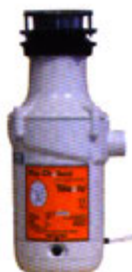
CHELSEA Standard model